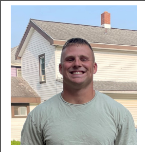
Age Group: 8u